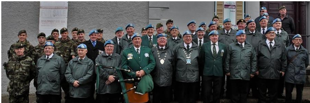
A group photograph of members of IUNVA Post 25 Fermoy with members of the Cav Club, other veterans of Fitzgerald Camp and personnel from 1 Cav Sqn.