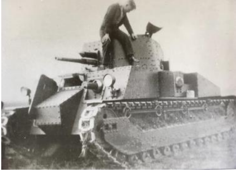
One of the L60As on the Curragh Plains in the late 1930s.

1930s. Two Landsverk L60A Light Tanks were procured from Sweden in 1935 – 36 The L60s remained in service up to the early 1960s, one is now in the Curragh Museum and the second is in the National Museum in Collins Bks.