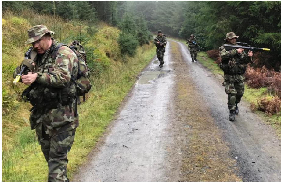
2 Bde Cav Sqn Reserve Detachment

this exercise from map reading and navigation to setting up, operating and maintaining the Singar radio to moving tactically and rehearsing their actions on drills and practice using night vision equipment and the thermal imager. All essential tools and skills that would be needed and used by an OP detachment.