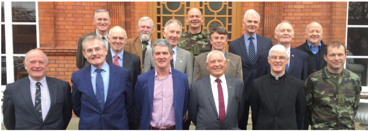
Guests and members of the committee at McKee Officers Mess.