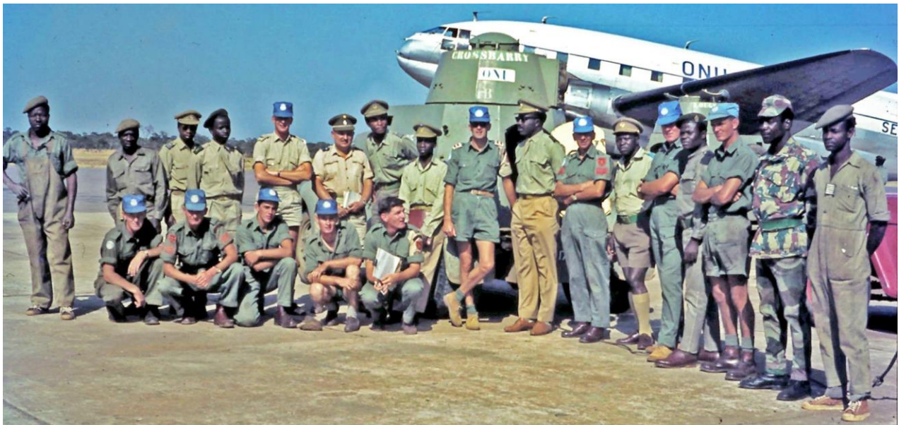
2 Inf Gp Armd Car Gp personnel at the handover and identified are: