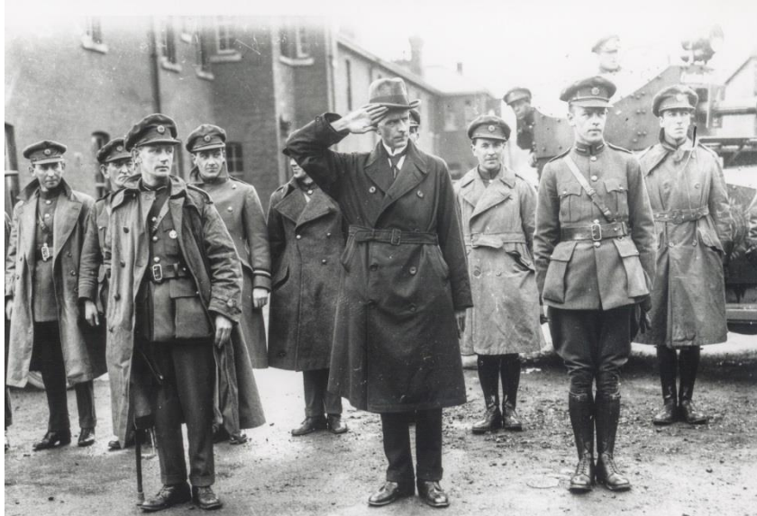
L to R: Comdt Gen Tom Ennis, Gen Eoin O'Duffy and Maj Gen Emmet Dalton, the ARR Custom House is behind the reviewing party.

17 May 1922. The National Army took over Portobello Bks from the Worcestershire Regt of the British Army. The contingent included around 800 men of the Dublin Bde and two armoured Rolls Royce, The Big Fella and The Custom House.