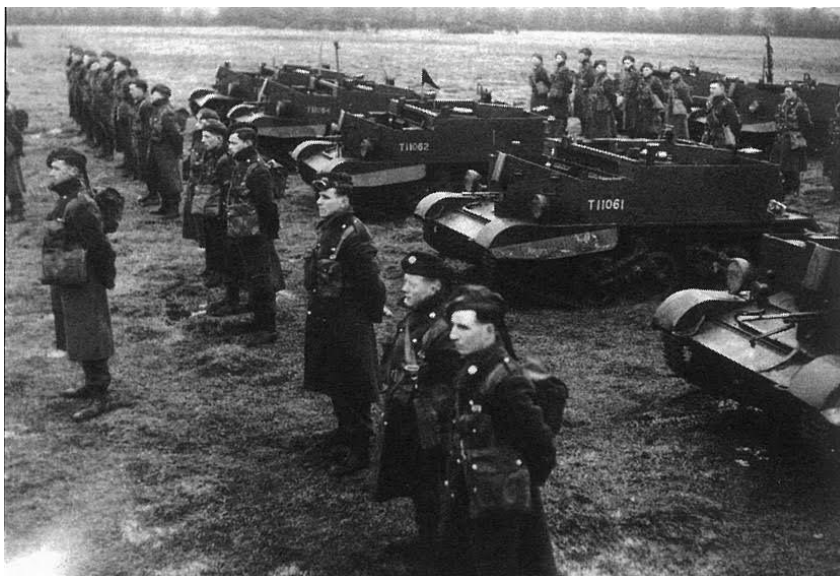
The Carrier Sqn at Dromoland Castle in 1942.

In 1942 all Tps were located in Co Clare at Dromoland Castle and at Hurlers Cross. The Carrier Sqn was disestablished in 1943 and personnel were posted to the newly formed 4 Armd Sqn. A number of Carriers were kept in service and they were used for tracked driver training in the Cav Sch up to the early 1960s.