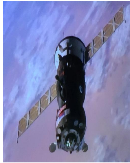
The view from the ISS of Soyuz.