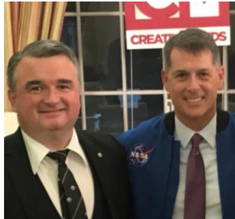
In the US Ambassadors' Residence