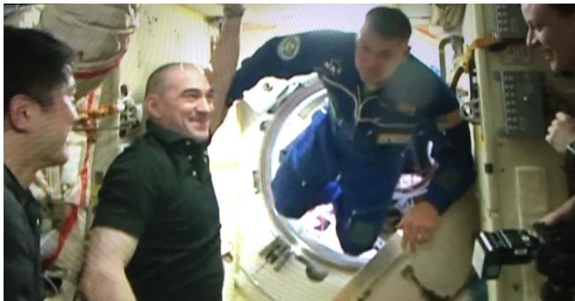
Moving into his new accommodation.