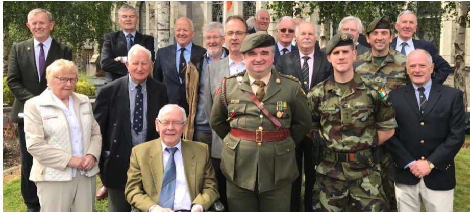
Some of the Club members who the ceremony.