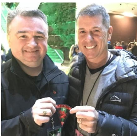
In Dublin with my unit Flash.