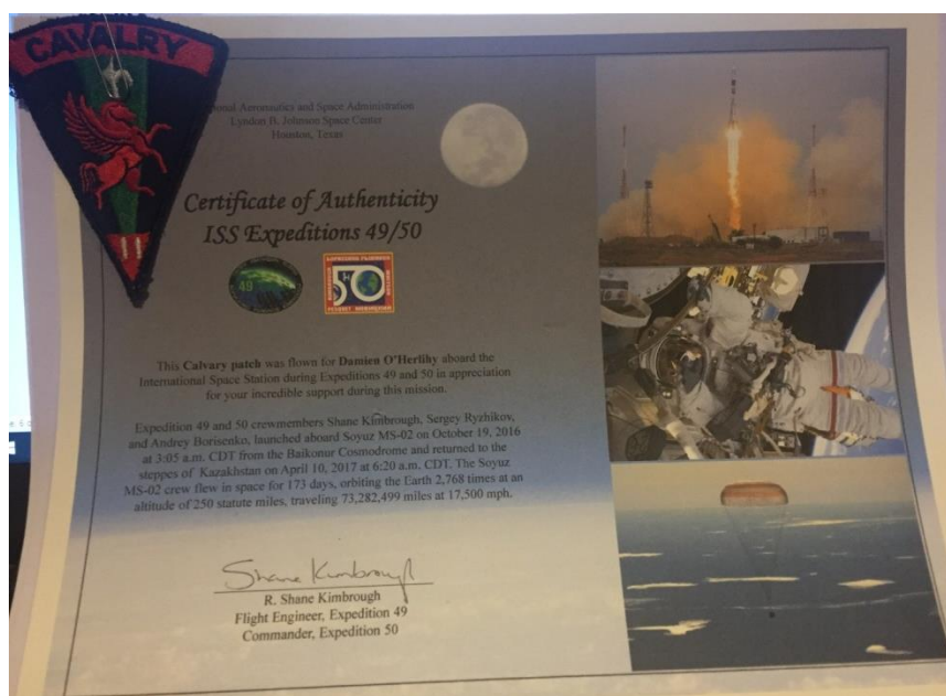
Certificate from NASA.