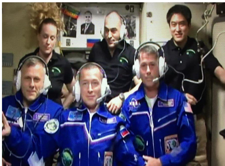
Checking in with mission control and family after successfully completing the docking procedure.