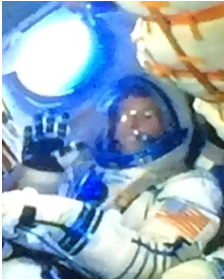
Inside Soyuz as they were taking off.