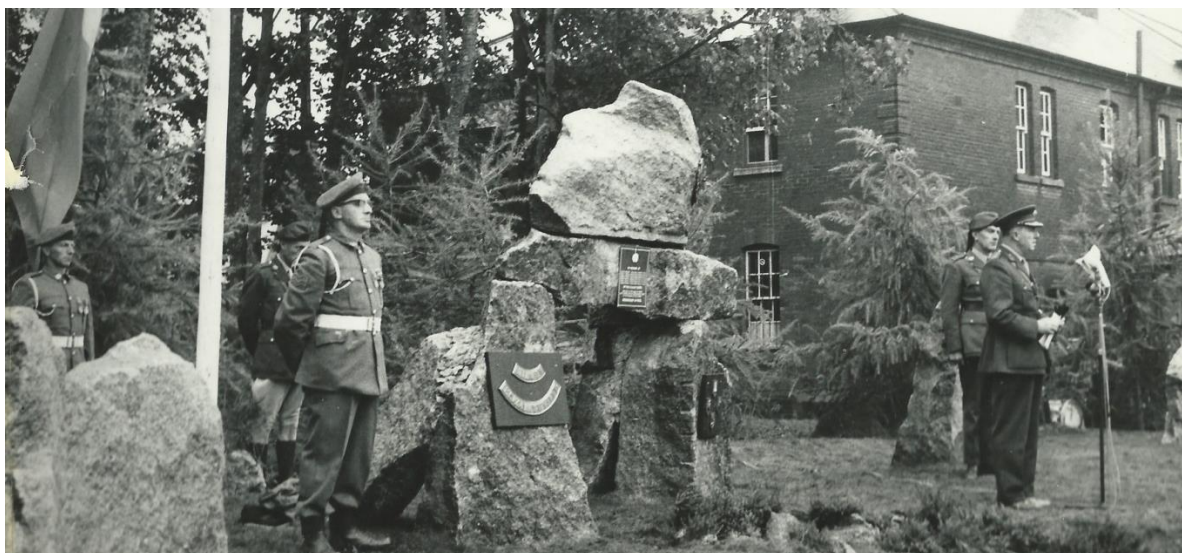
The opening of the Cavalry Corps Memorial Garden in 1963.

All members of the Club are encouraged to attend and to wear medals.