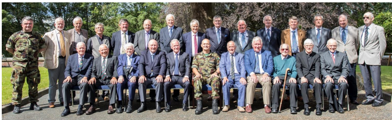
A group shot of the diners after the lunch.