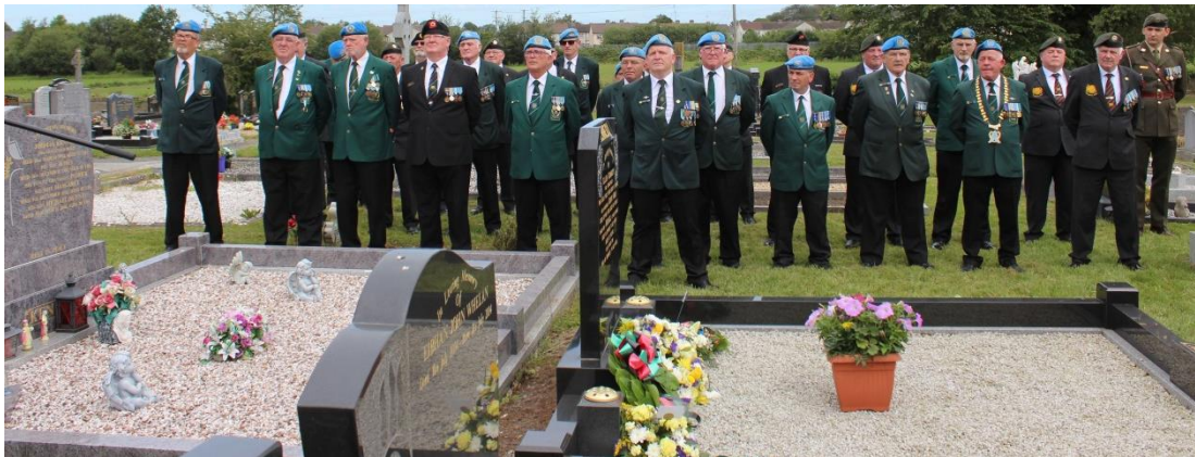
Members of IUNVA, ONE, 2 Cav Sqn Veterans Association and the Glengarry Club at the grave.